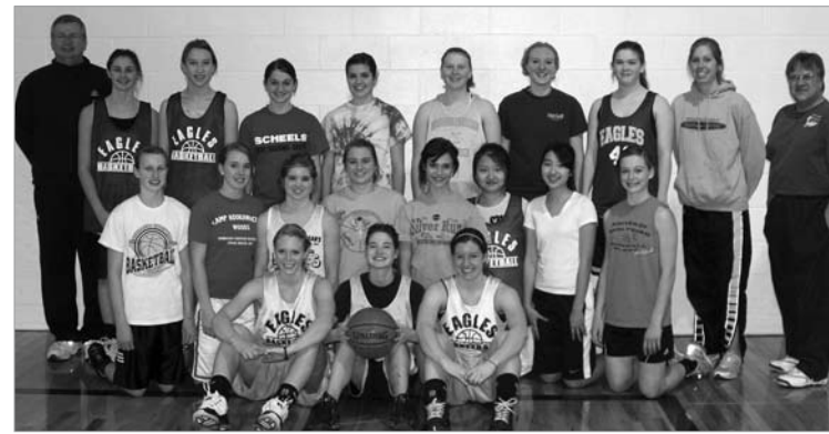
'09-'10 Girls' Basketball.